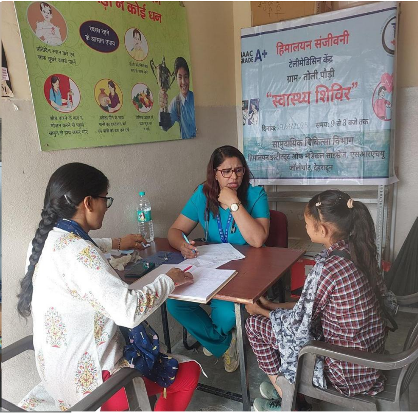
Toli Dudharkhal, Uttarakha Hill Campus, Toli Dudharkhal, Uttarakhand Lat 29.874279° Long 78.790817° 27/04/2025 11:07 AM GMT +05:30