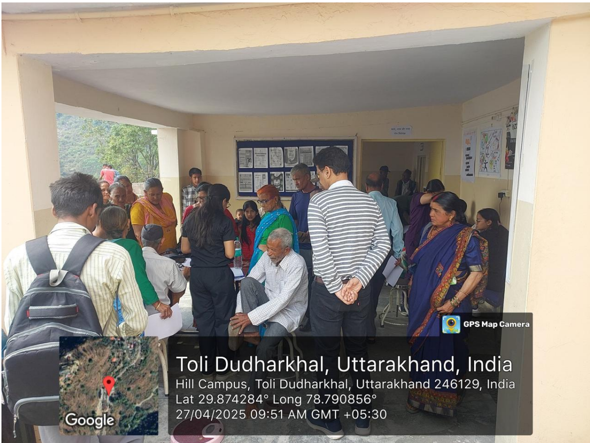
Toli Dudharkhal, Uttarakhand, India Hill Campus, Toli Dudharkhal, Uttarakhand 246129, India Lat 29.874284° Long 78.790856° 27/04/2025 09:51 AM GMT +05:30